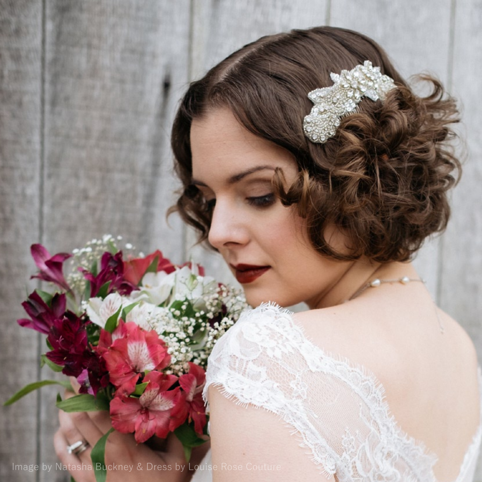
& Dress by Louise Rose Couture